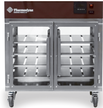
*Unit pictured without optional stainless push bar.