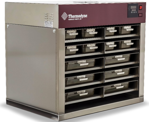
Unit shown with optional pans and lids

Thermodyne's 700NDNL counter-top holding unit provides food quality and kitchen efficiency like no other piece of equipment on the market today. Using patented Fluid Shelf® technology each shelf in the cabinet maintains an exact temperature, allowing for extended holding times, without sacrificing appearance or taste. The 700NDNL has twice the capacity of our 300NDNL model and also requires no door. Units are available as pass through or with a solid panel back.